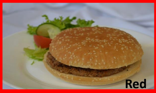
Beef Burger in Bun