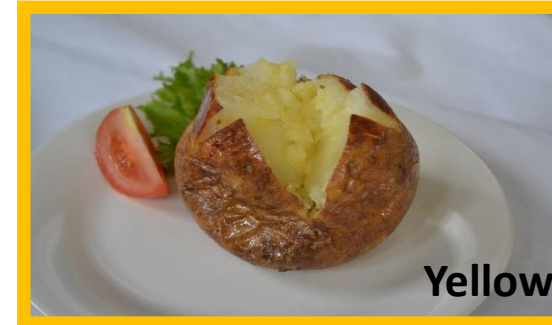
Jacket Potato with Choice of Fillings Cheese, Tuna or Bake Beans