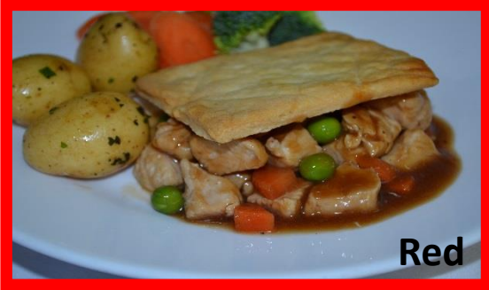
Chicken & Vegetable Pie