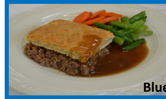
Quorn & Vegetable Pie