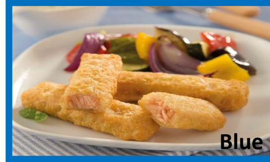
Salmon Fish Fingers