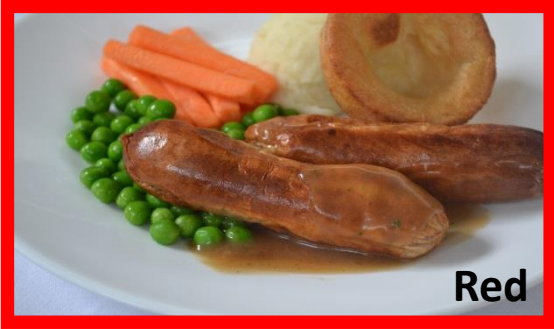
Baked Sausage with Yorkshire Pudding