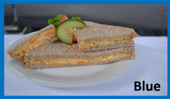
Cheese Savoury Sandwich