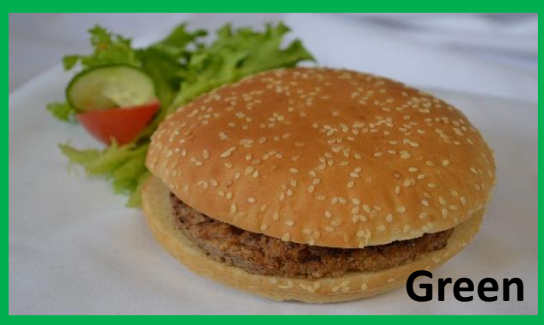
Quorn Burger in Bun