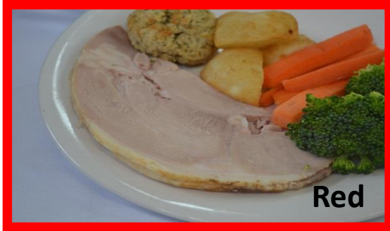
Roast Turkey with Sage & Onion Stuffing