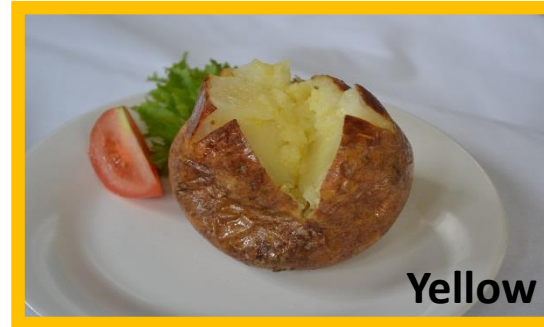
Jacket Potato with Choice of Fillings Cheese, Tuna or Bake Beans