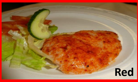
BBQ Chicken Grill