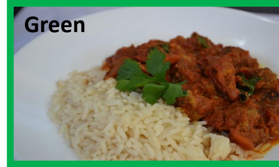
Quorn & Lentil Jalfrezi