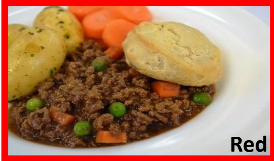
Savoury Mince & Dumpling