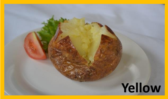
Jacket Potato with Choice of Fillings Cheese, Tuna or Bake Beans