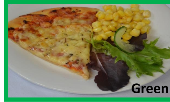
Homemade Cheese & Tomato Pizza