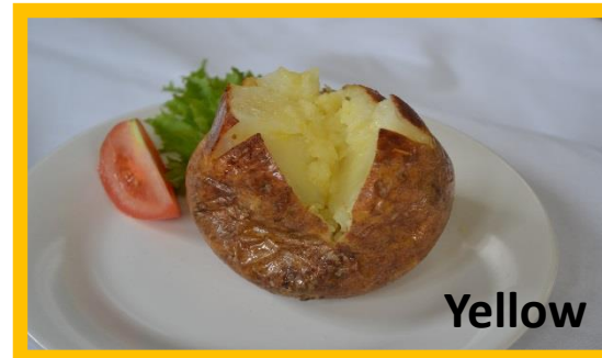
Jacket Potato with Choice of Fillings Cheese, Tuna or Bake Beans