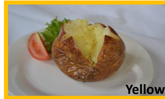
Jacket Potato with Choice of Fillings Cheese, Tuna or Bake Beans