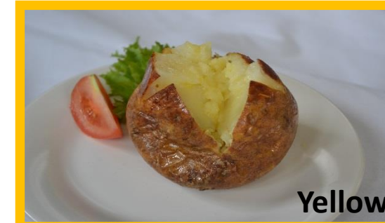
Jacket Potato with Choice of Fillings Cheese, Tuna or Bake Beans