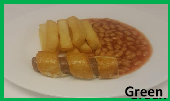
Quorn Sausage Roll