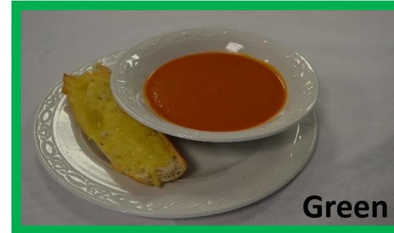
Homemade Tomato Soup