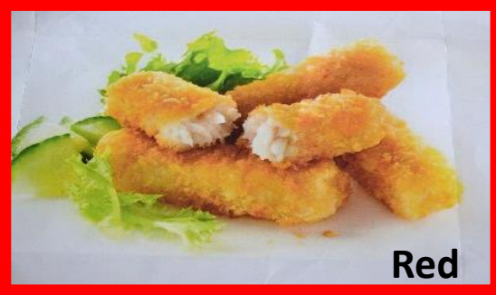
Cod Fish Fingers