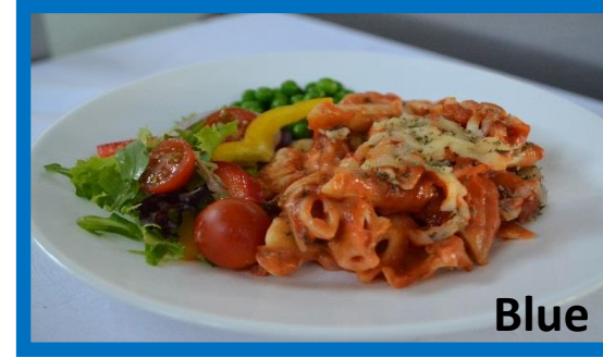
Tuna Pasta Bake