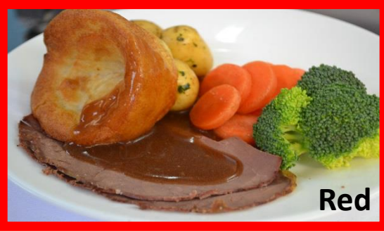
Roast Beef with Yorkshire Pudding