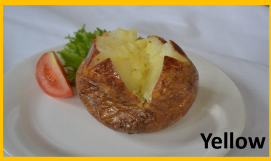
Jacket Potato with Choice of Fillings Cheese, Tuna or Bake Beans